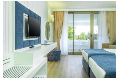
** Comfort Std. Sea Room **