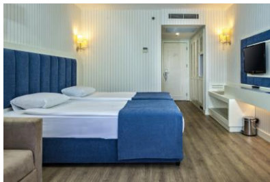
** Comfort Std. Land Room **

** Land View, Side Sea View and Sea View alternatives are available.