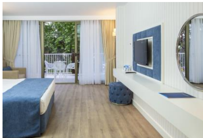
** Comfort Std. Land Room **