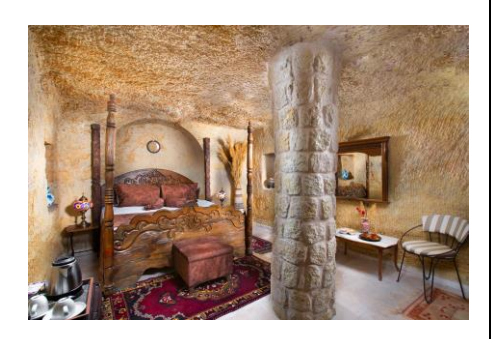
Deluxe Cave Suite HELEN ROOM