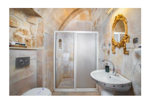
Junior Cave Suite AGAPE ROOM