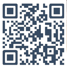
Scanning QR code for A-la Carte restaurant booking Ethno Loca / Trattoria Italian / Wazuzu Asian