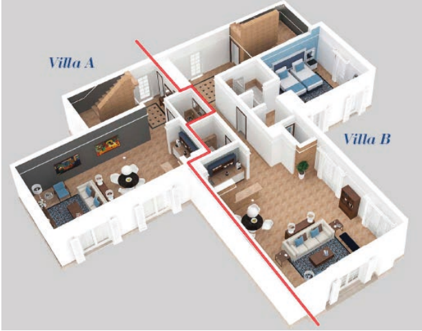
AZURE Villas / 2 yatak odalı / Alt Kat