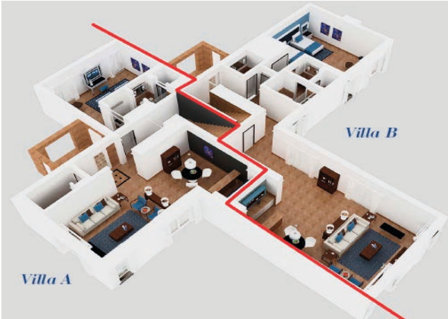
AZURE Villas / 3 yatak odalı / Alt Kat